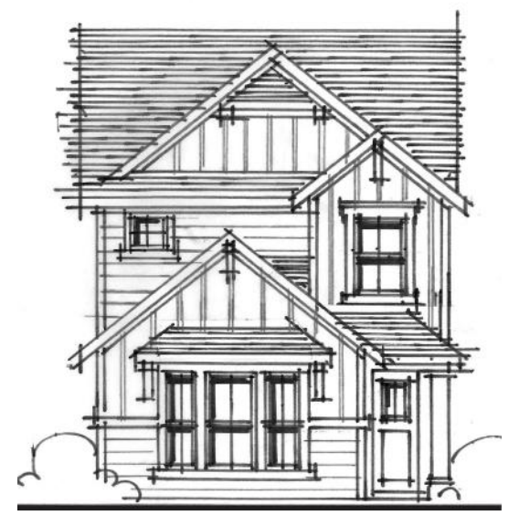
ELEVATION -C Farmhouse